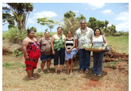
7.14.12 Hālau Hula Pa`akea Wailehua of Kailua