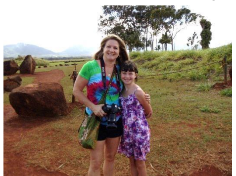
7.8.12 Waialua 'Ohana noi aku before entering and mahalo aku before leaving...