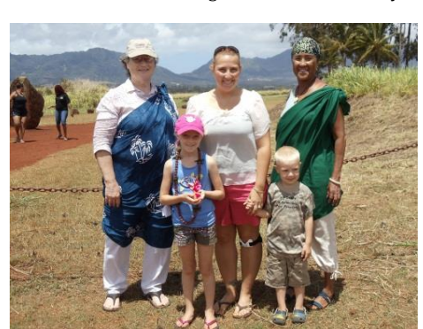
7.14.12 Homebirthing mom here for dad's R & R